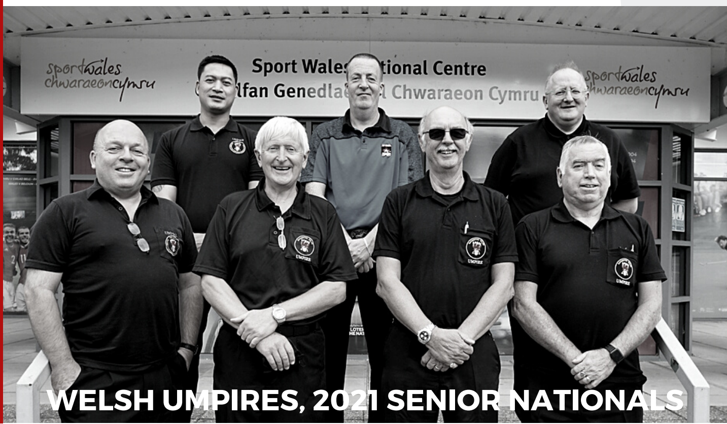
WELSH UMPIRES, 2021 SENIOR NATIONALS

Thank you to all of our badminton volunteers, our volunteering Tournament organisers and technical officials who give up their time to ensure that Badminton events in Wales are able to run at a high standard. We are, as always, forever grateful for your support and your contributions to our Sport. Diolch i bob un o'n Gwirfoddolwyr Badminton ledled Cymru.