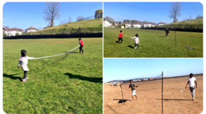
EYST - Ethnic Minorities & Youth Support Team Wales and 4 others

Many thanks to the recent donation of badminton sets by @BadmintonWales & @StreetGameWales. We managed to get them out to families of young people in our communities and networks. We hope this helps them to have some fun, family time and stay active. #SportHelps #StayActive